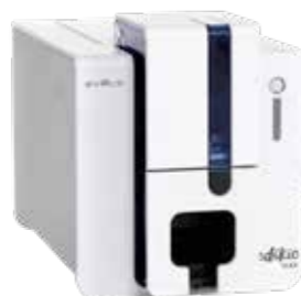
Evolis Edikio Flex

The middle model of the range prints - also on one side - both cards in normal ISO format and cards up to 150mm long for your display or counter. Perfect if you want to be flexible in the size of the signage. Product information is managed via product lists.