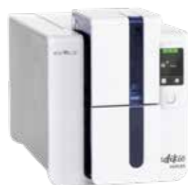
Evolis Edikio Duplex

The middle model of the range prints - also on one side - both cards in normal ISO format and cards up to 150mm long for your display or counter. Perfect if you want to be flexible in the size of the signage. Product information is managed via product lists.