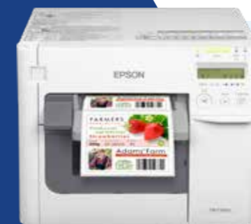
Epson ColorWorks C3500